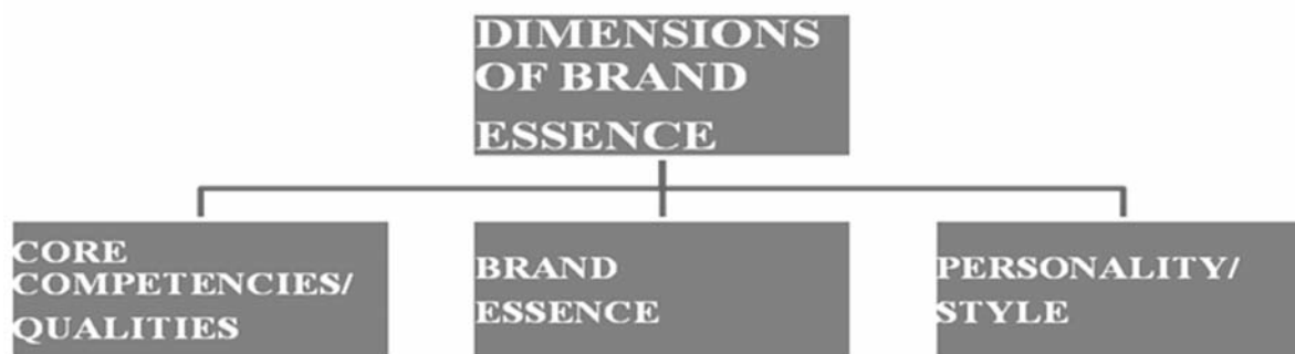
Figure 5. Dimensions of brand essence

Aaker's model is the same as we have with many similar marketing models. No one would disagree that the factors listed-brand loyalty and so on-are in themselves good things. The difficulty is that there is absolutely no evidence that they are related systematically to brand equity-whatever that is. High brand equity provides a company with many competitive advantages. A powerful brand enjoys a high level of consumer brand awareness and loyalty. Because consumers expect stores to carry the brand, the company has more leverage in bargaining with the resellers. Because the brand carries the high credibility, the