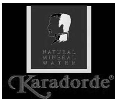
Figure 3. Old logo of Karadjordje mineral water