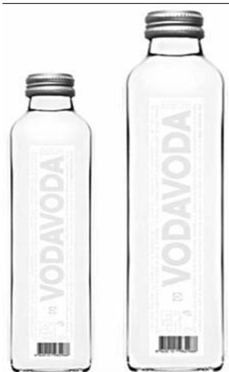
Figure 1. Design of Vodavoda bottle

They wanted to create a vessel which would become a connector between nature and the individual. At the same time, rational and pragmatic aspects of the package design were of critical importance for the vodavoda water. They have developed square PET bottle that can fit more bottles per given footprint than the regular common round bottle. This meant more bottles delivered to people for less energy, and for easier handling (see Figure 1).