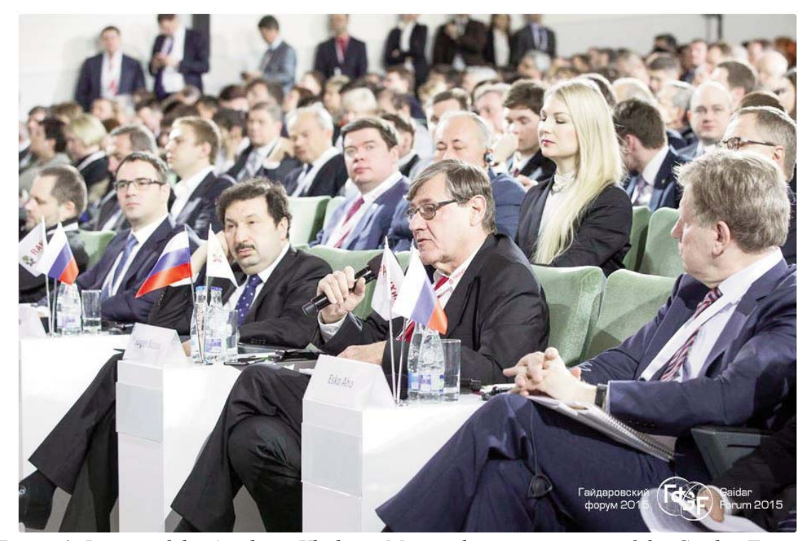
Figure 1. Rector of the Academy Vladimir Mau and representatives of the Gaidar Forum