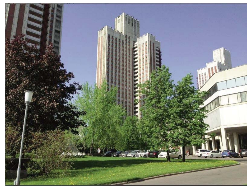
Figure 2. The building of the RANEPA campus in Moscow

abundantly equipped with modern auditoriums. libraries, sports facilities. stadiums. cafeterias. restaurants. dormitories, business centers, and guesthouses. The central building of the RANEPA academy in Moscow is presented in Figure 2.