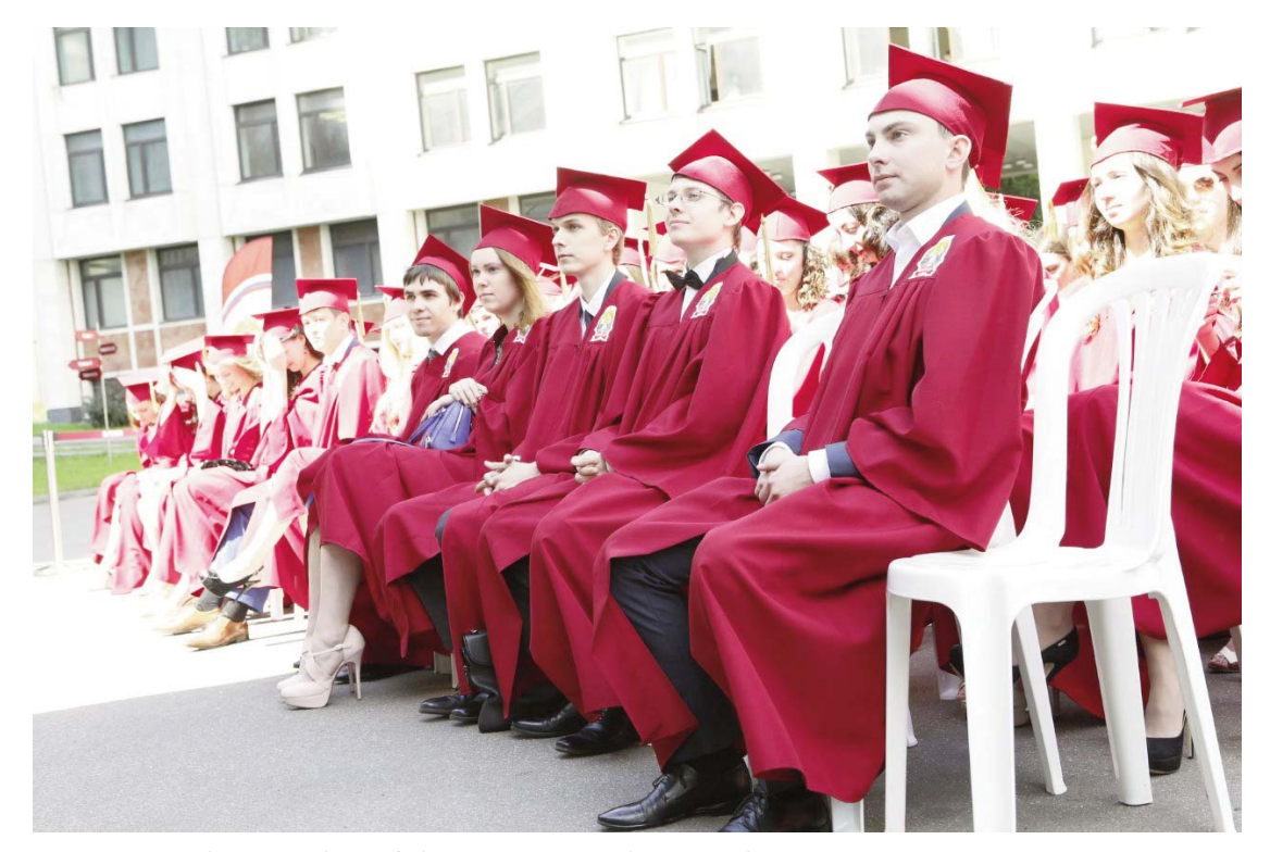
Figure 5. Graduation day of the Ranepa students – class 2015

containing 1,104,658 items, including those in foreign languages, of which 282,780 pieces of learning materials, including 83,237 compulsory publications, 112,338 works of fiction, and 710,450 pieces of scientific research have become the center of this process. A total of 911 copies of publications in electronic form on CD-media containing audio-visual materials are available at the Library. The Electronic Library System "The University Library" contains 4,220 electronic textbooks. A total of 1993 terminals currently provide access to the Electronic Library System, modern databases. professional reference information, search engines, and the Internet. All students, listeners, and teaching staff of the Academy are provided with free access to the following world science and information systems: