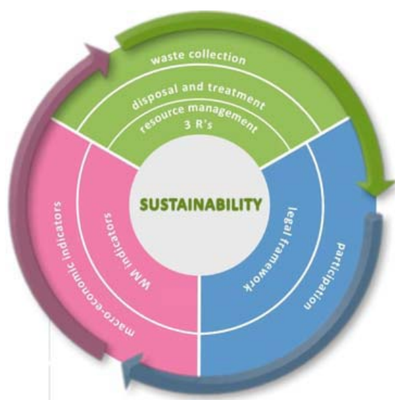
Figure 1. Model of sustainable solid waste management (Topić, 2014)

KLAMPFL-PERNOLD phase model allows an indicator-based classification of different countries or regions to determine the stage of waste management development. The classification of the development stage of waste management in a country or a region can be stated by using a few key parameters without large-scale, on-site surveys. The parameters are classified by using an economic, social, legal and ecological perspective. Depending on the waste management phase, certain waste management measures are appropriate and effective.